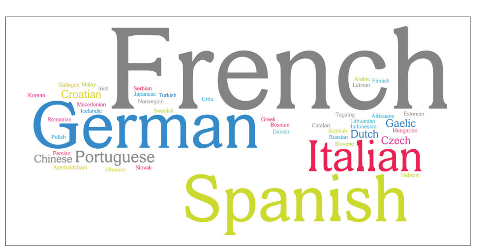
Figure 1: Word cloud containing the Languages other than English used in publications in the Arts & Humanities between 2008 and 2012.